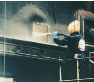
Safe, nontoxic cleaning