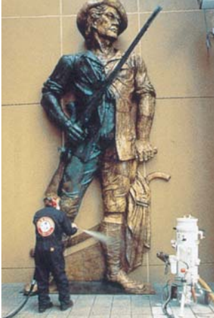
Bronze statue cleaned with the ARMEX and Accustrip System®