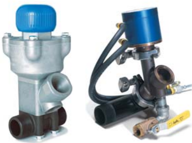
Features Thompson Valve II (left) or ARMEX® Media Valve (right)